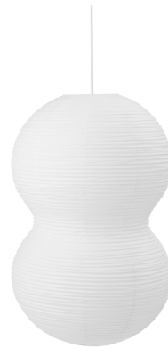
Puff Lamp Twist H: 90 x Ø50 cm