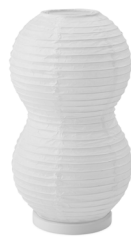
Puff Table Lamp Twist H: 28,5 x Ø16 cm