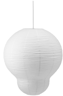
Puff Lamp Bulb H: 75 x Ø60 cm