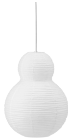
Puff Lamp Bubble H: 50 x Ø35 cm