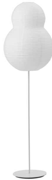
Puff Floor Lamp Bubble H: 153,5 x Ø45 cm

Materials: Pendants: Rice paper lampshade. Table Lamp & Floor lamp: Rice paper, white powder-coated steel pole & base with soft EVA foam underneath, to protect the floor.