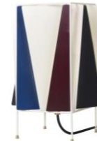
// French Blue