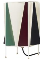
// Salvie Green