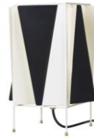
// Black & White