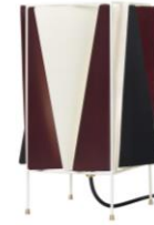
// Wine Red