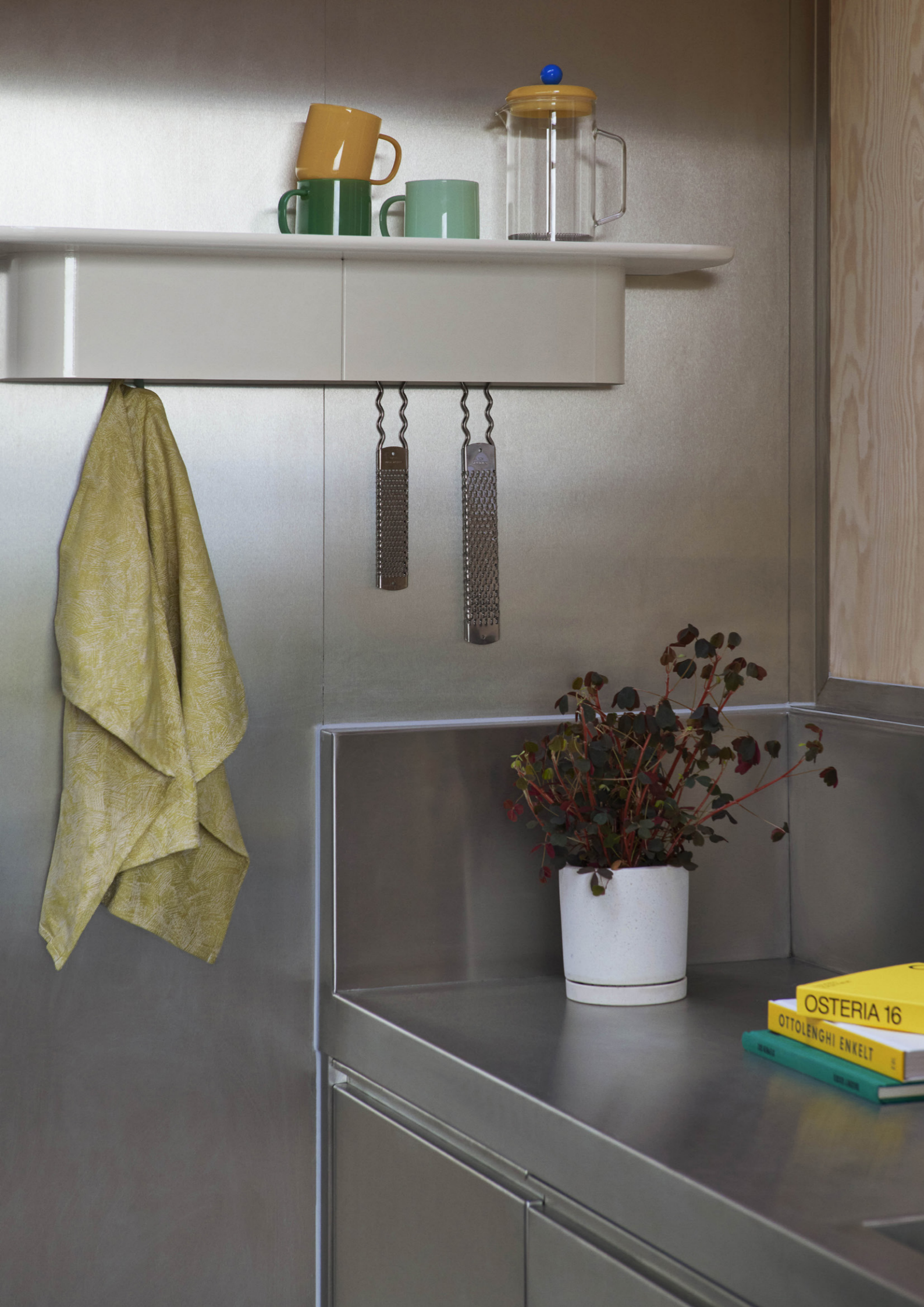
- KORPUS SHELF -