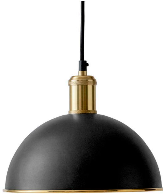
Black/Brushed Brass 1935859