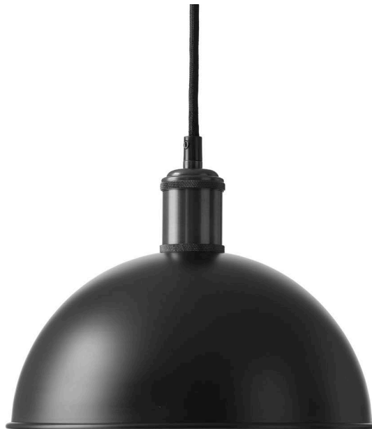
Black/Gun Metal 1935539