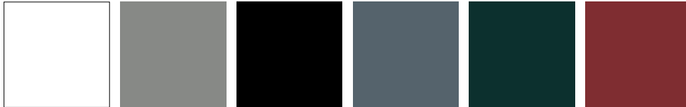
White Grey Black Blue Green Red