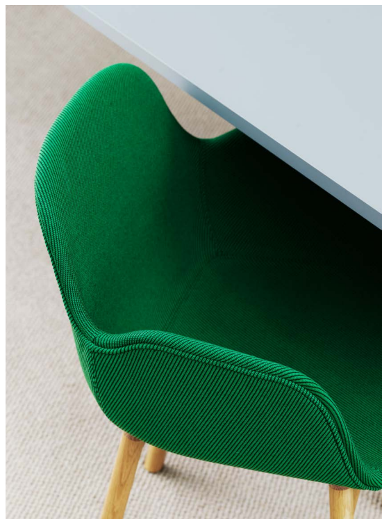
Form armchair full upholstery oak