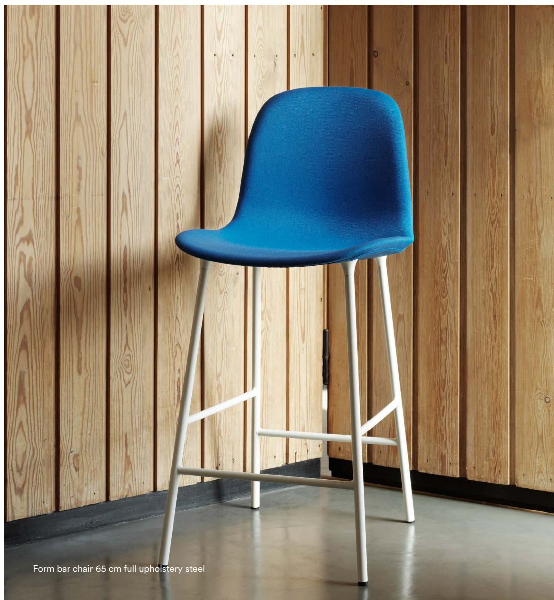
Form bar chair 65 cm full upholstery steel