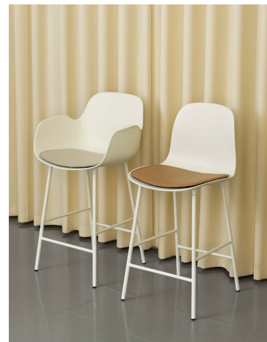
Form bar armchair 65 cm steel with seat cushion, Form bar chair 65 cm steel with seat cushion