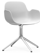
Form armchair swivel 4L H: 80 x L: 70,5 x D: 70,5 x SH: 44 x AR: 66,5 cm