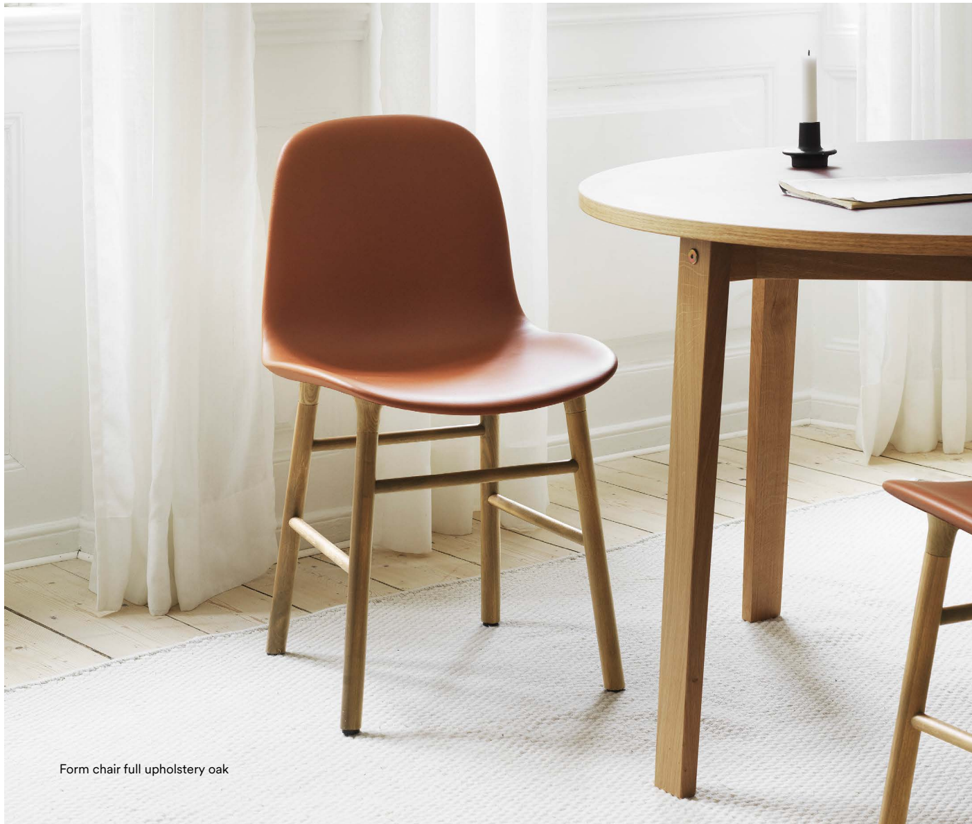
Form chair full upholstery oak