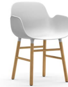
Form armchair wood H: 80 x L: 56 x D: 52 x SH: 44 x AR: 66,5 cm