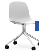
Form chair swivel 4W H: 80 x L: 54 x D: 55,5 x SH: 45 cm