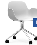
Form armchair swivel 4W H: 80 x L: 54 x D: 55,5 x SH: 45 cm