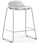
Form bar stool 65 cm stacking steel, chrome H: 77,5 x L: 58,5 x D: 45 x SH: 65 cm