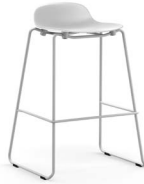
Form bar stool 75 cm stacking steel, chrome H: 77,5 x L: 60,5 x D: 48,5 x SH: 75 cm