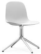
Form chair swivel 4L H: 80 x L: 70,5 x D: 70,5 x SH: 44 cm