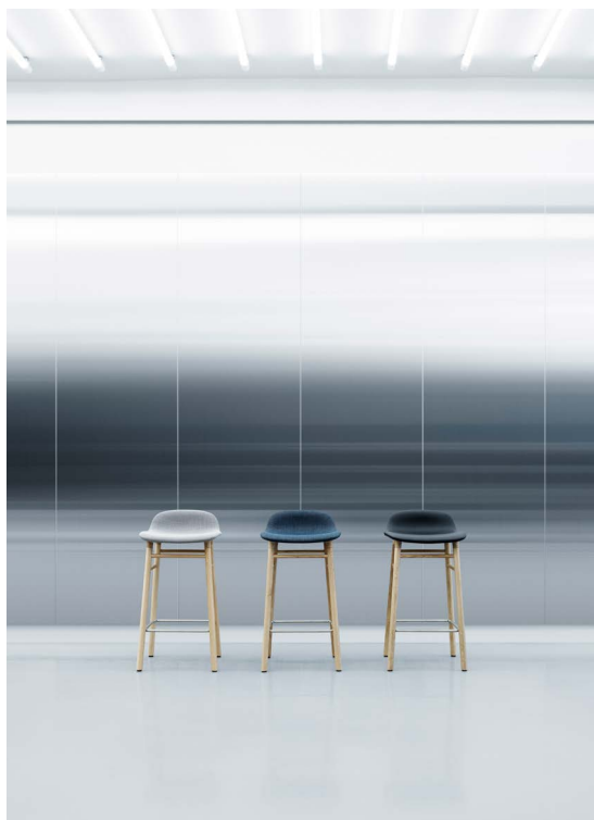
Form bar stool 65 cm full upholstery oak