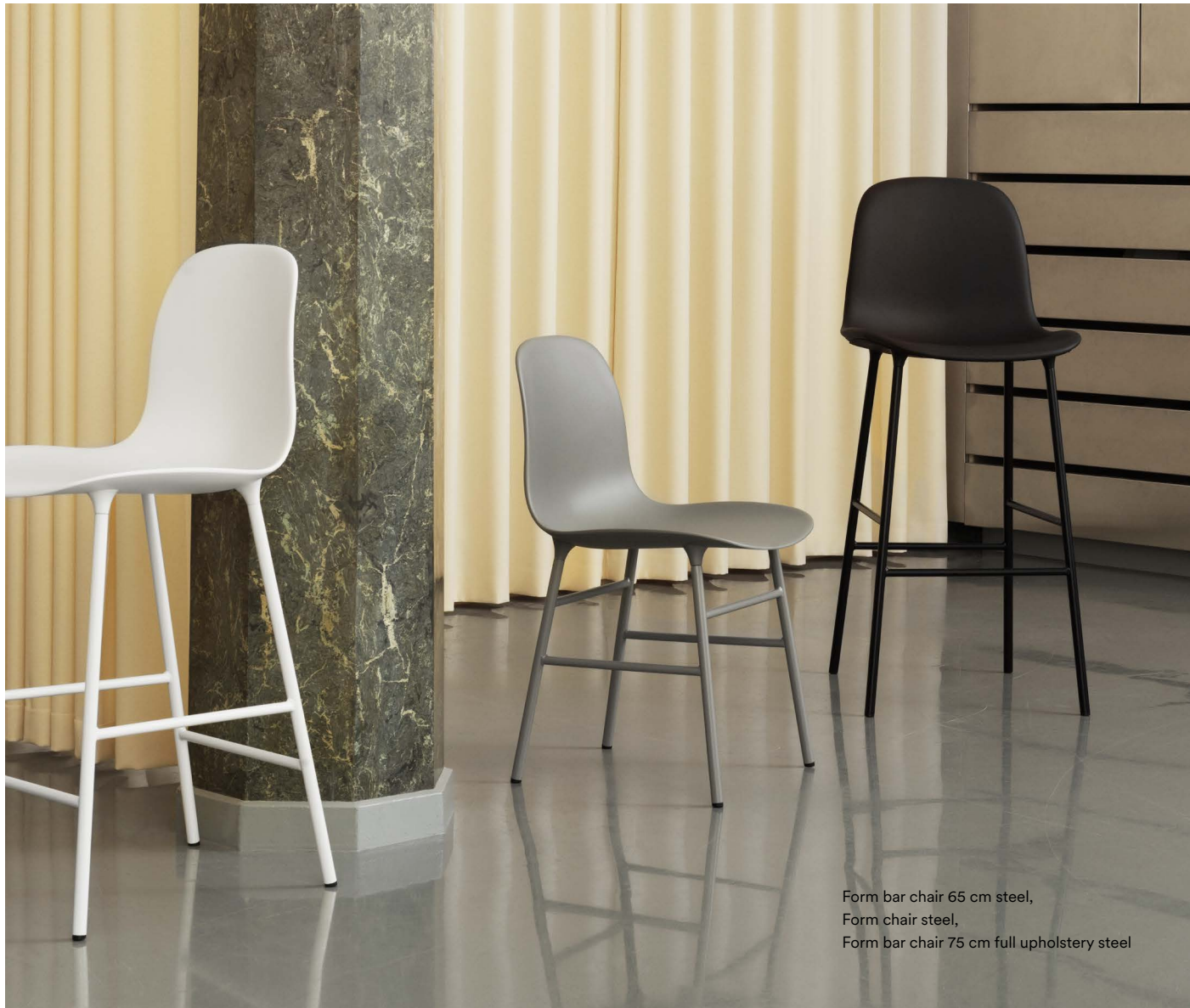
Form bar chair 65 cm steel, Form chair steel, Form bar chair 75 cm full upholstery steel