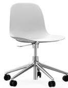
Form chair swivel 5W gaslift H: 73/86 x L: 60 x D: 52 x SH: 37/50 cm