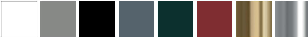
White Grey Black Blue Green Red Brass Chrome