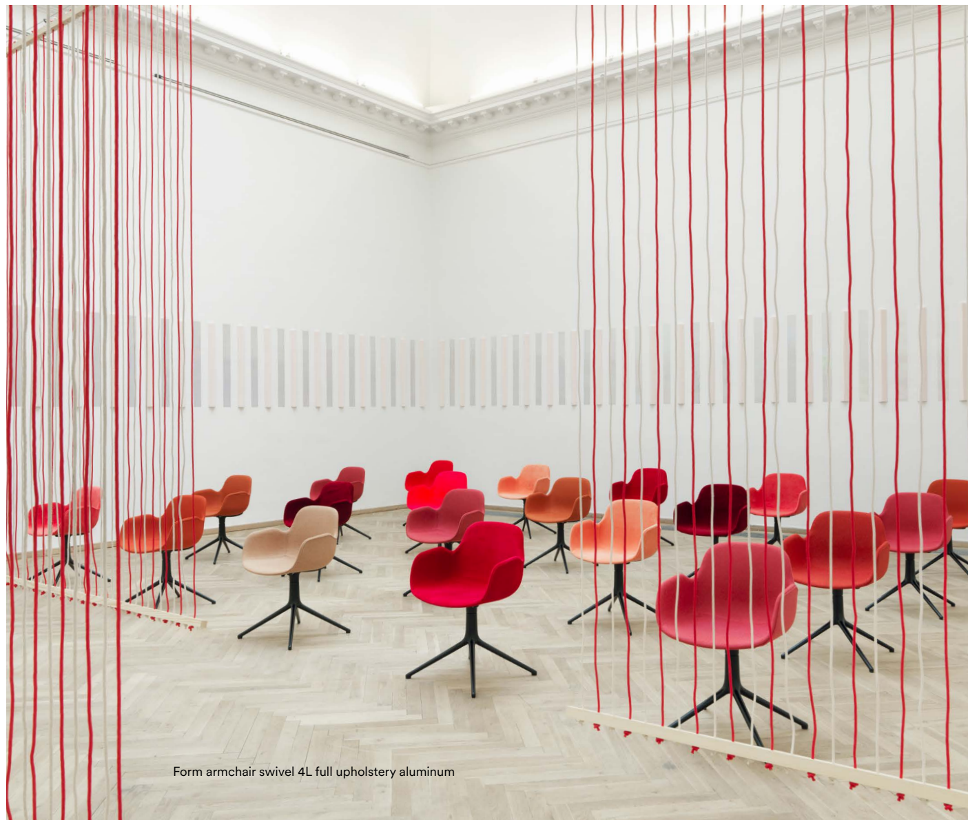
Form armchair swivel 4L full upholstery aluminum

We recommend to check and tighten screws every 3-6 months. Please make sure your choice of glides is suitable for the type of flooring. We recommend to check the glides every 3-6 months. If worn down, please replace.