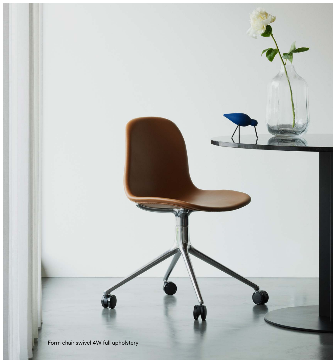
Form chair swivel 4W full upholstery