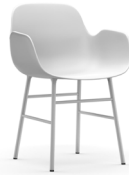
Form armchair steel, chrome, brass H: 80 x L: 56 x D: 52 x SH: 44 x AR: 66,5 cm