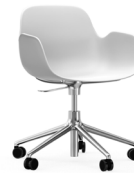
Form armchair swivel 5W gaslift H: 73/86 x L: 72,5 x D: 72,5 x SH: 37/50 x AR: 59/72 cm