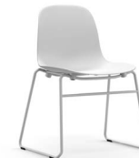
Form chair stacking steel, chrome H: 80 x L: 58,5 x D: 52 x SH: 44 cm