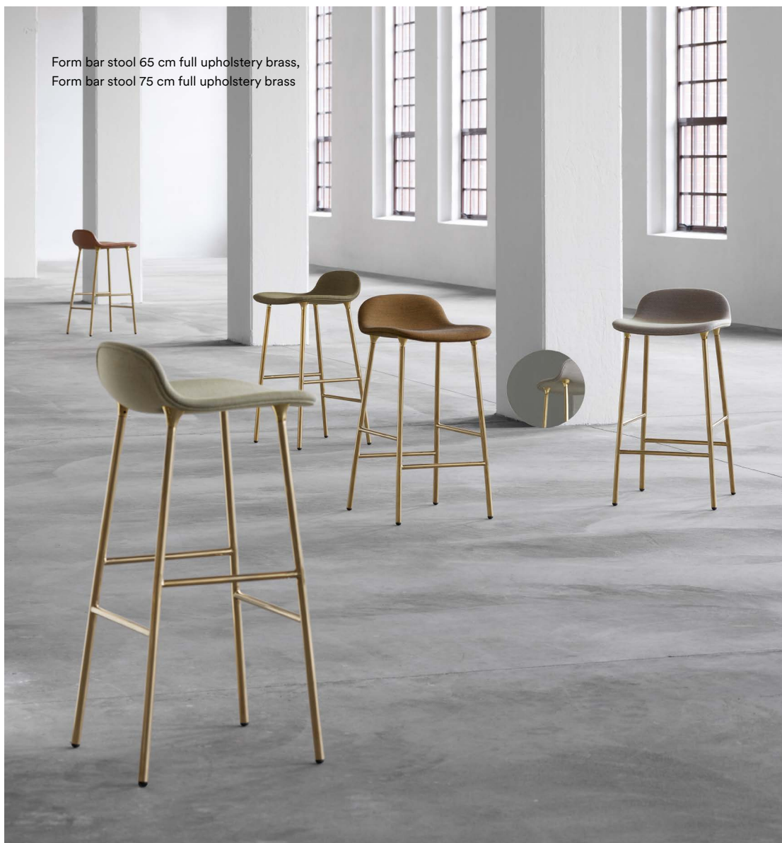
Form bar stool 65 cm full upholstery brass, Form bar stool 75 cm full upholstery brass