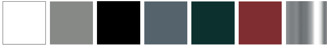
White Grey Black Blue Green Red Chrome