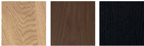
Oak Walnut Black