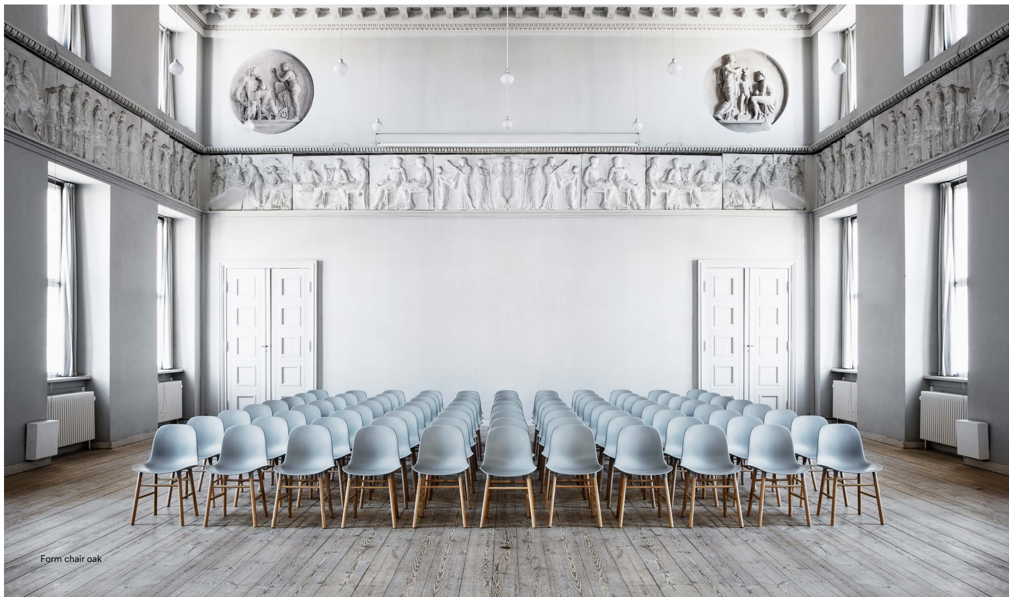
Form chair oak