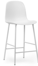
Form bar chair 65 cm steel H: 100 x L: 48 x D: 52 x SH: 65 cm