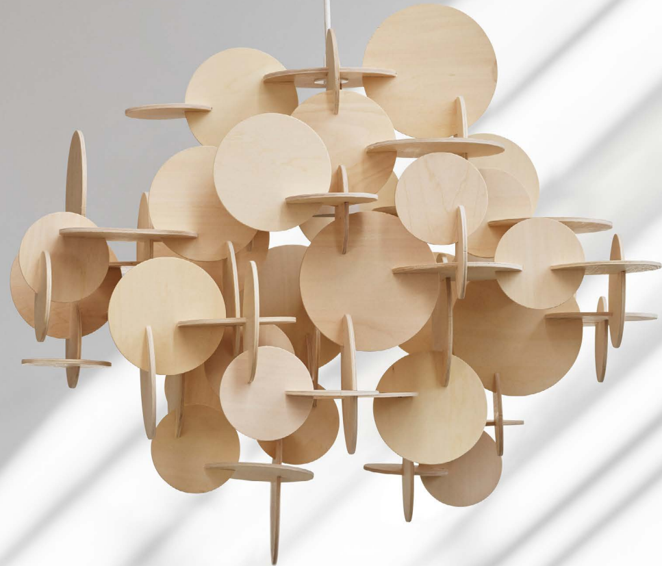
Bau Lamp small

The design is based on interlocking geometric circles, sticking out in all directions. Bau has an immediate pattern that is broken up by the discs' sizes and off-centre linkages, making the lamp living and organic in its expression.