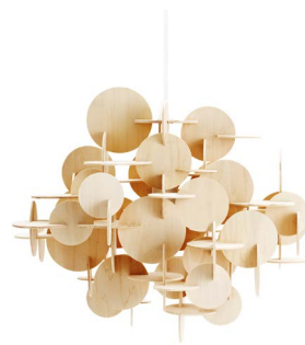
Bau Lamp large H: 51 x L: 57 cm