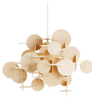
Bau Lamp small H: 44 x L: 57,5 cm