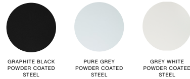
GRAPHITE BLACK POWDER COATED STEEL