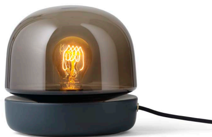
Stone / Glass 1850139