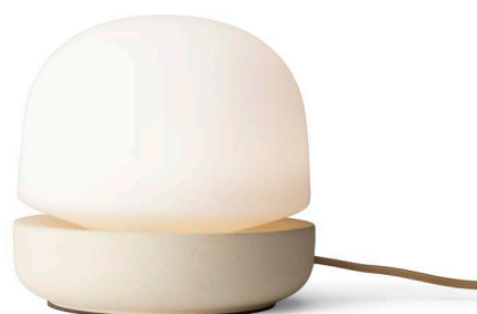
White/Light Brown Clay 1850039